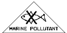
Marine pollutant mark