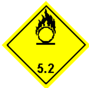
Class 5.2 Organic peroxides