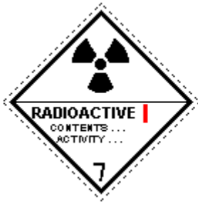
Category I – White