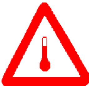
Elevated temperature substances