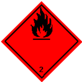
Class 2.1 Flammable gases