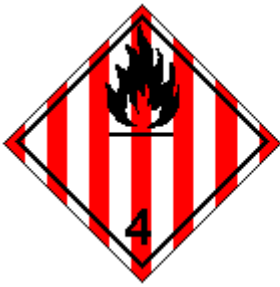
Class 4.1 Flammable solids