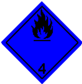
Class 4.3 Substances that, in contact with water, emit flammable gases