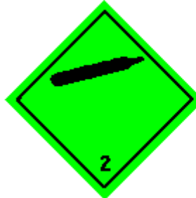
Class 2.2 Non-flammable, non-toxic gases