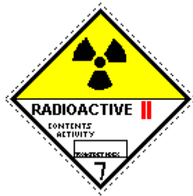
Category II – Yellow