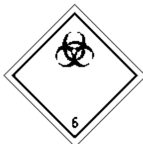
Class 6.2 Infectious substances