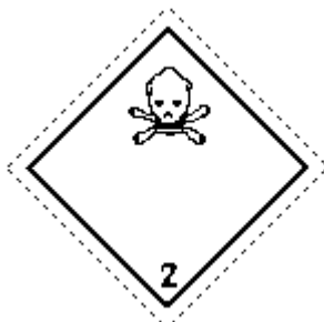
Class 2.3 Toxic gases