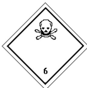
Class 6.1 Toxic substances