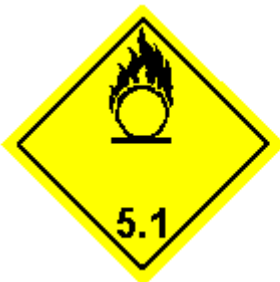
Class 5.1 Oxidizing substances