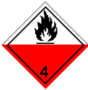
Class 4.2 Substances liable to spontaneous combustion