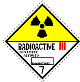
Category III – Yellow