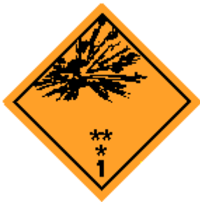
Divisions 1.1, 1.2 and 1.3